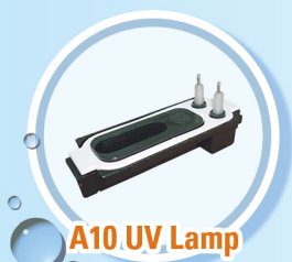
A10 UV Lamp

For any further information, please contact us by info@rephile.com .